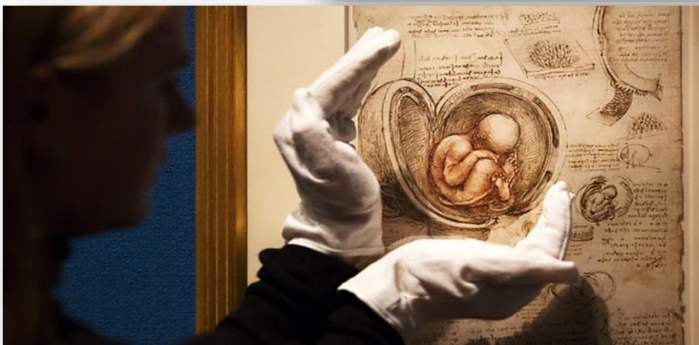
A work by Da Vinci